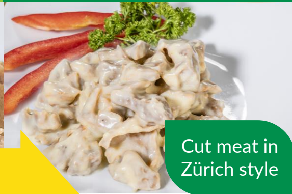
Cut meat in Zürich style